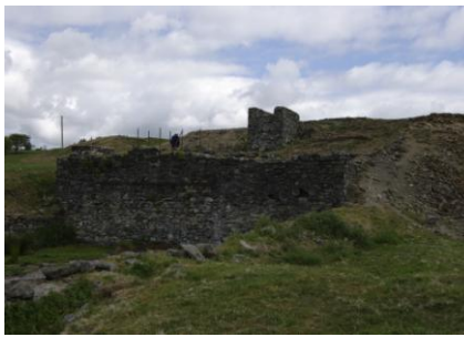
Cwm Mawr Mine