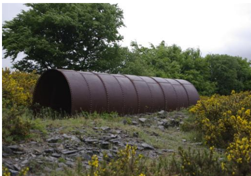
Llwyn Malus Mine

Walks will be 1 to 2 miles in length, mostly on roads and paths.