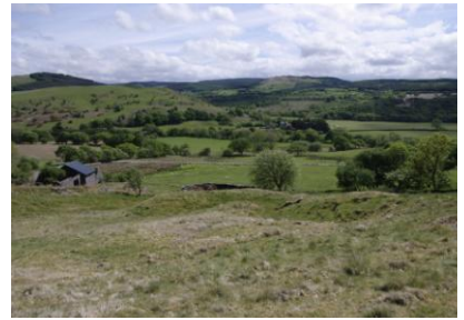
Abbey Consols Mine